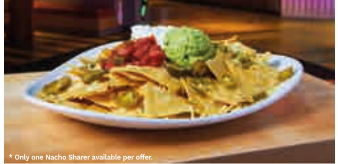
* Only one Nacho Sharer available per offer.