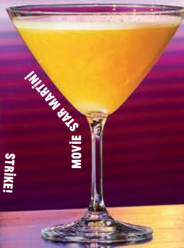
MOVIE STAR MARTINI